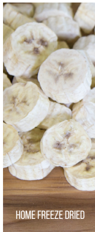
HOME FREEZE DRIED

A home freeze dryer is the best way to prepare for times of adversity, allowing you to easily preserve anything you eat. And, when packaged properly, the food will taste great and retain nearly all of its nutritional value for 25 years.