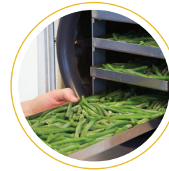
PRESERVE WHAT YOU ALREADY EAT