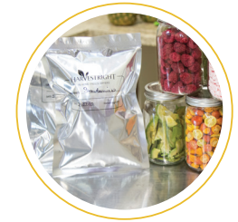
STORE IT IN A SAFE, COOL LOCATION