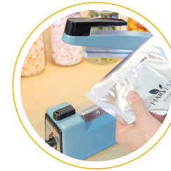
PACKAGE IT PROPERLY